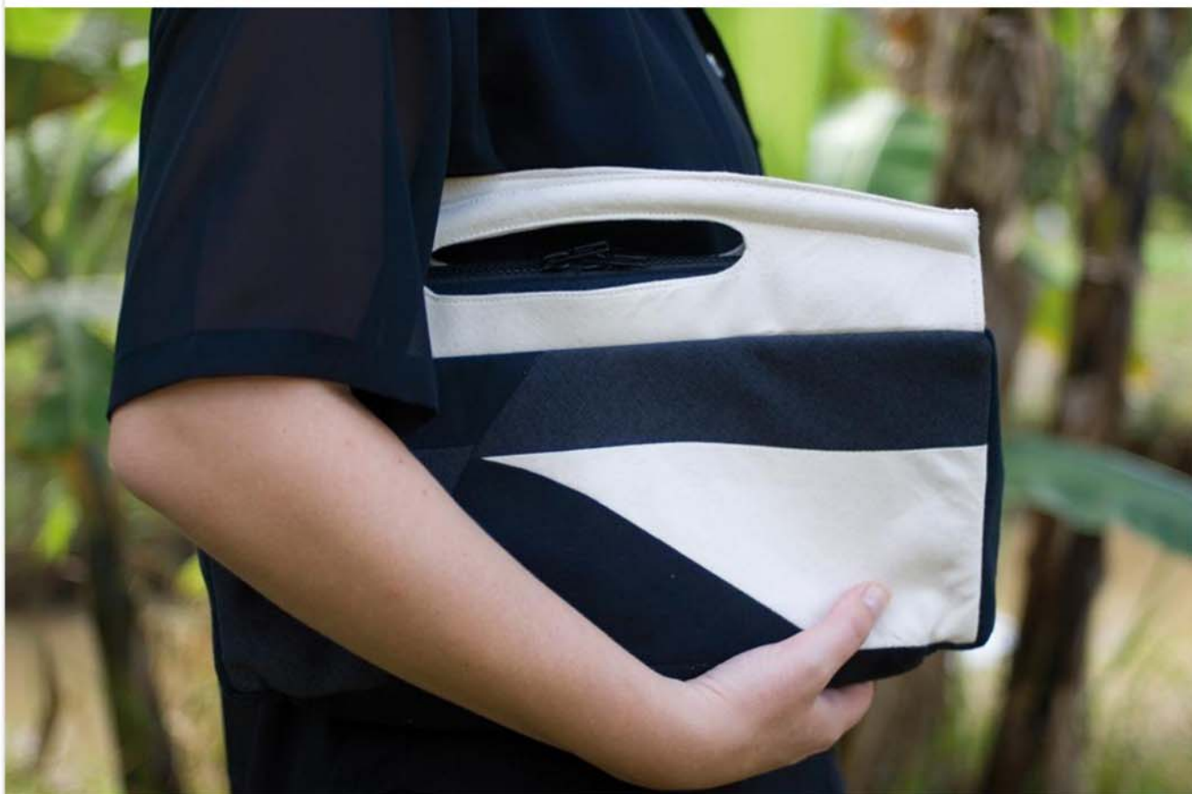
Fabric purse designed by Valentina Downey. Dignity Design