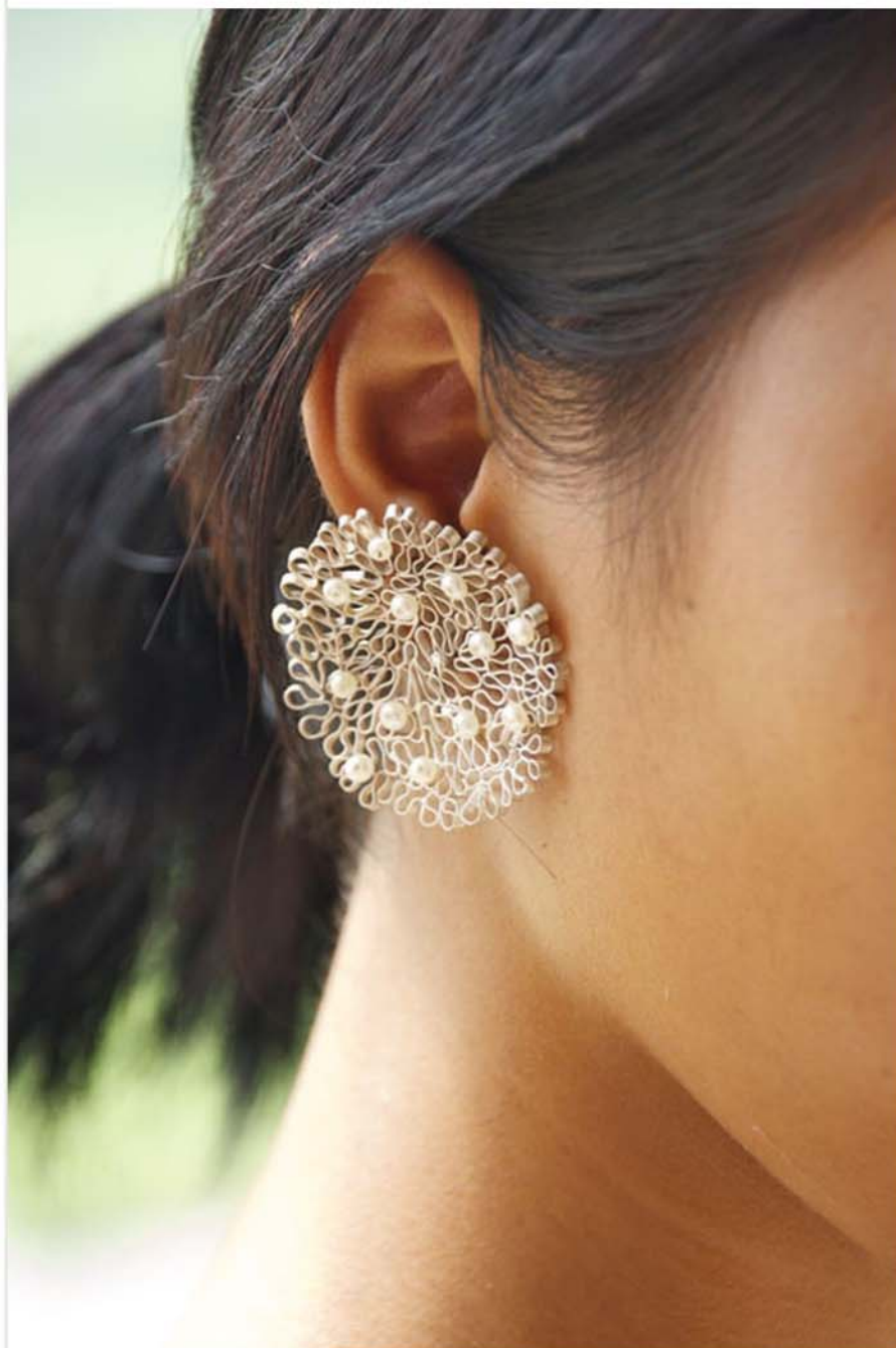
Silver earrings. La Bottega dell'Arte – Il Nodo Onlus